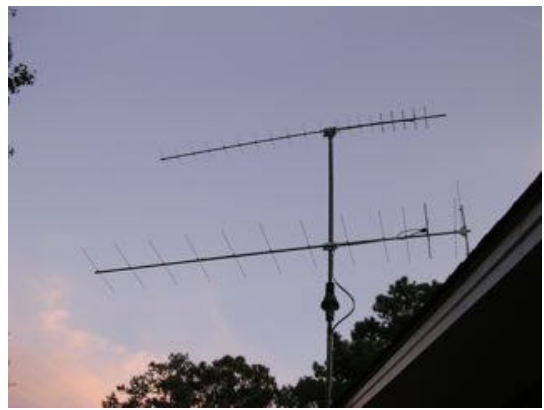
Ed's 2 meter & 70cm beams