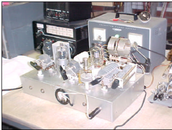
Ed's, W2UAS , 1930's HB 3-stage CW transmitter, on the air

The object is to encourage restoration, operation and enjoyment of this older "Classic" equipment. However, you need not operate a Classic rig to participate in the CX."